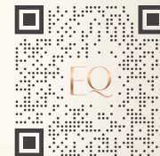
FOR BLUE RESERVATION

Access fee at RM108+ per person inclusive of one standard drink