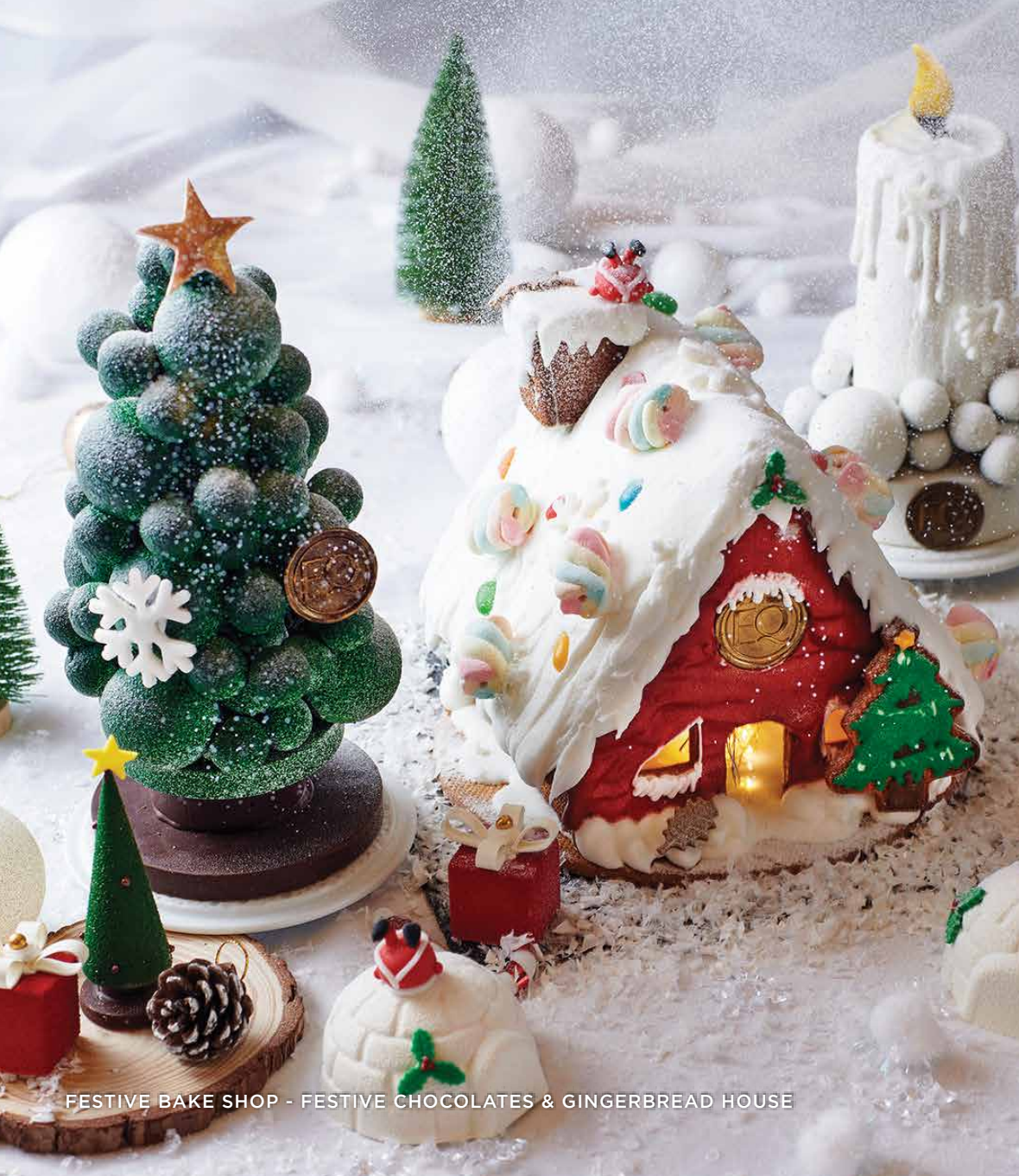
FESTIVE BAKE SHOP - FESTIVE CHOCOLATES & GINGERBREAD HOUSE