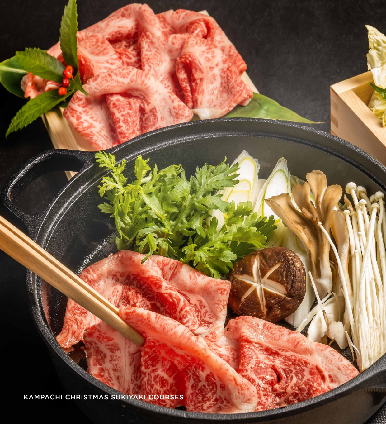
KAMPACHI CHRISTMAS SUKIYAKI COURSES