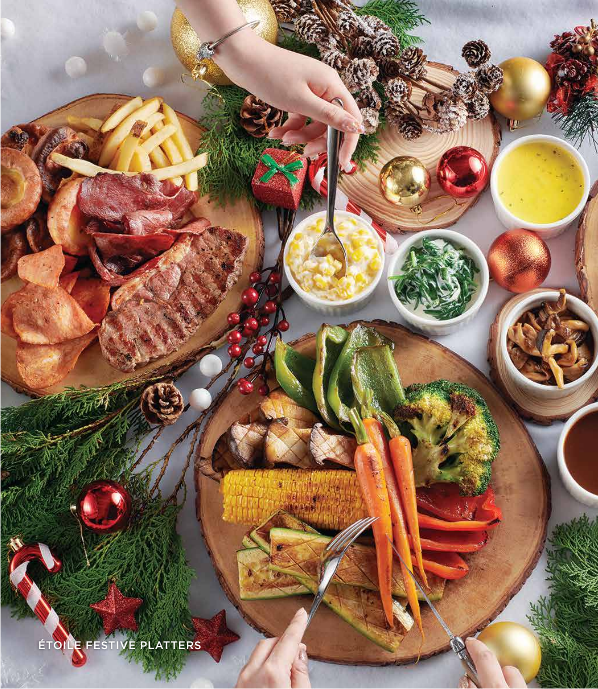
ÉTOILE FESTIVE PLATTERS