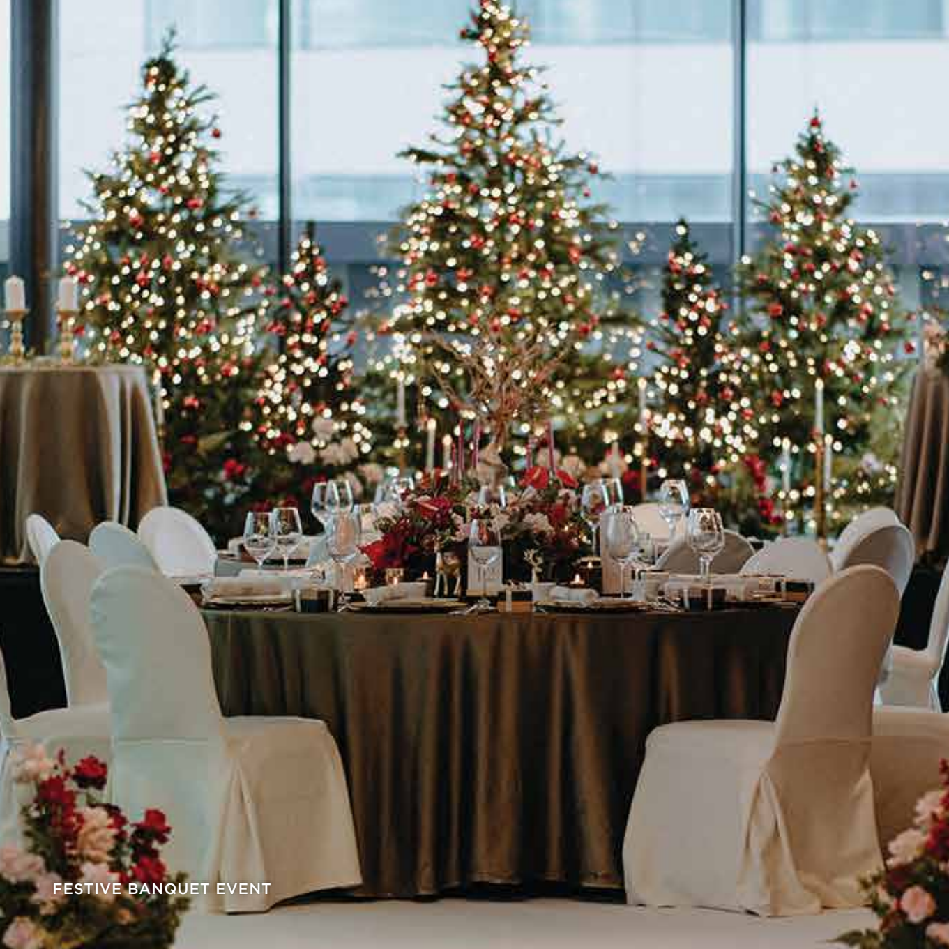
FESTIVE BANQUET EVENT