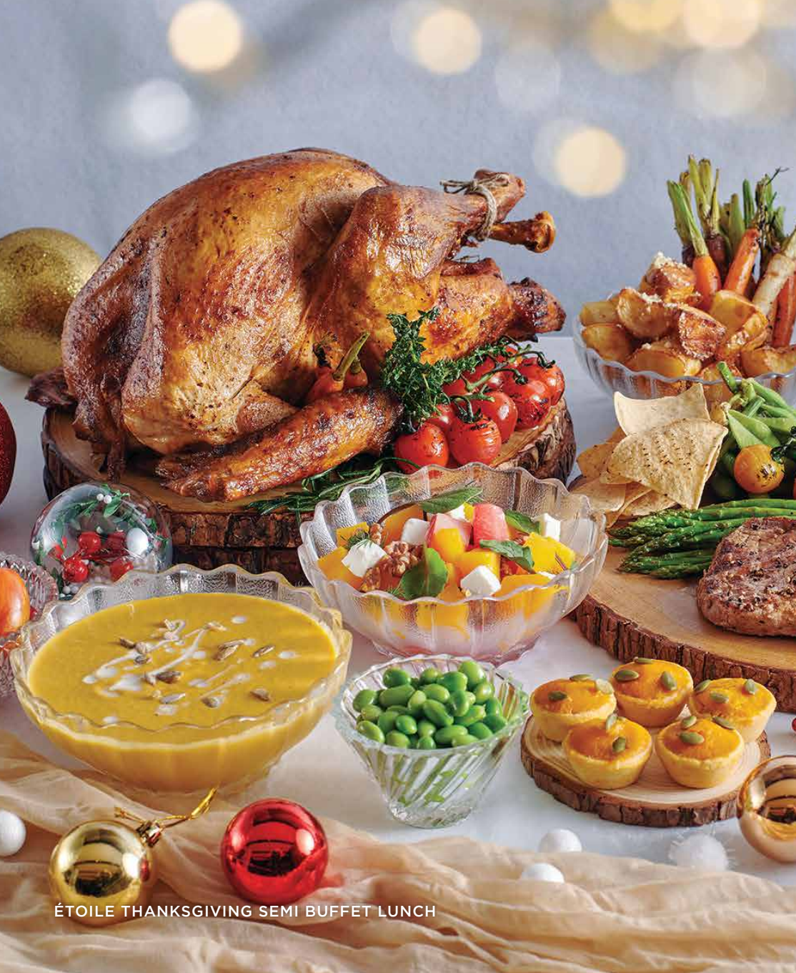
ÉTOILE THANKSGIVING SEMI BUFFET LUNCH