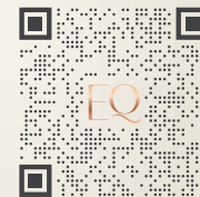
FOR ÉTOILE RESERVATION