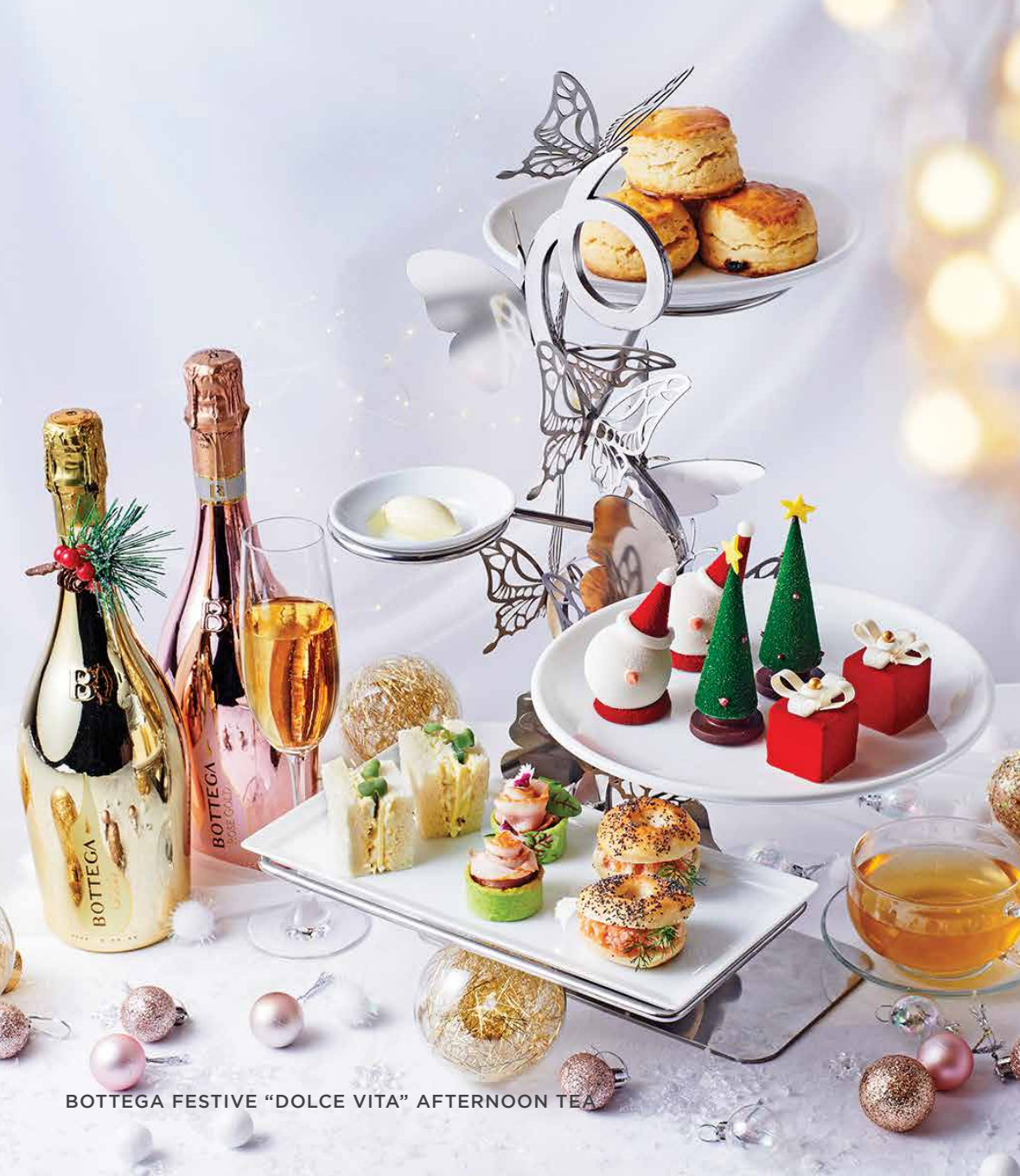
BOTTEGA FESTIVE "DOLCE VITA" AFTERNOON TEA