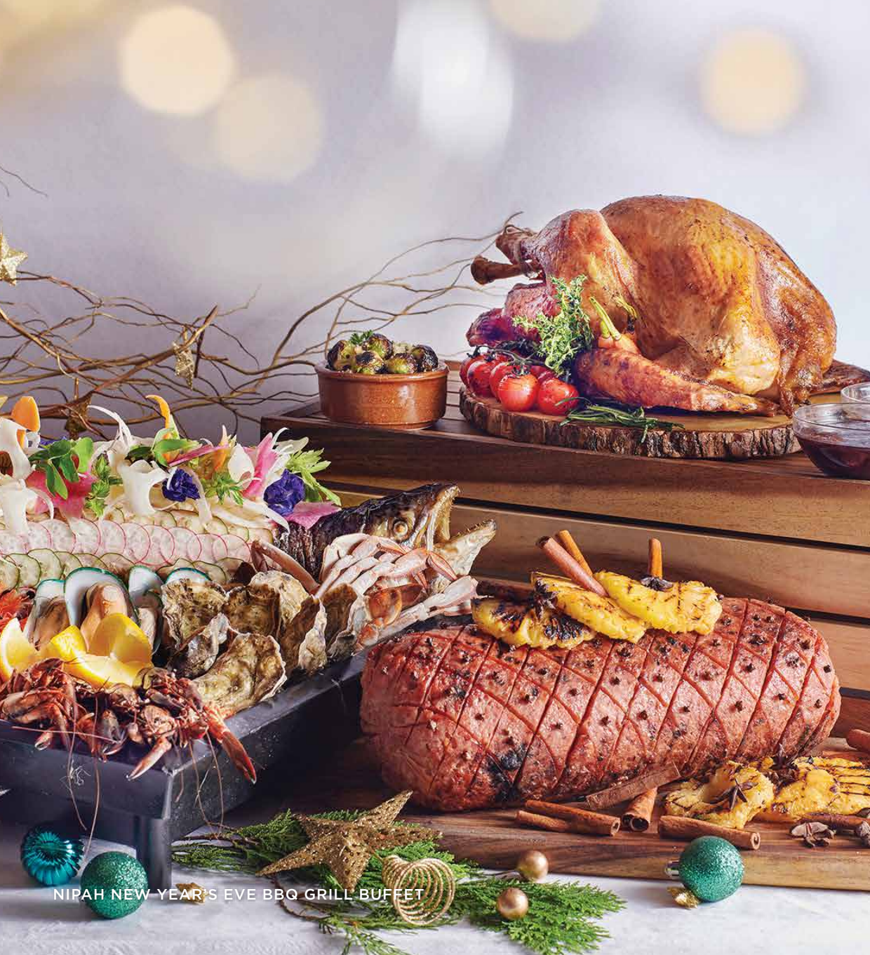
NIPAH NEW YEAR'S EVE BBQ GRILL BUFFET