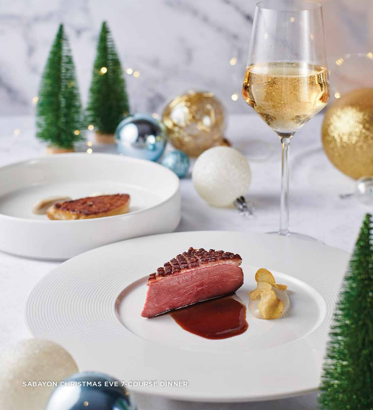
SABAYON CHRISTMAS EVE 7-COURSE DINNER