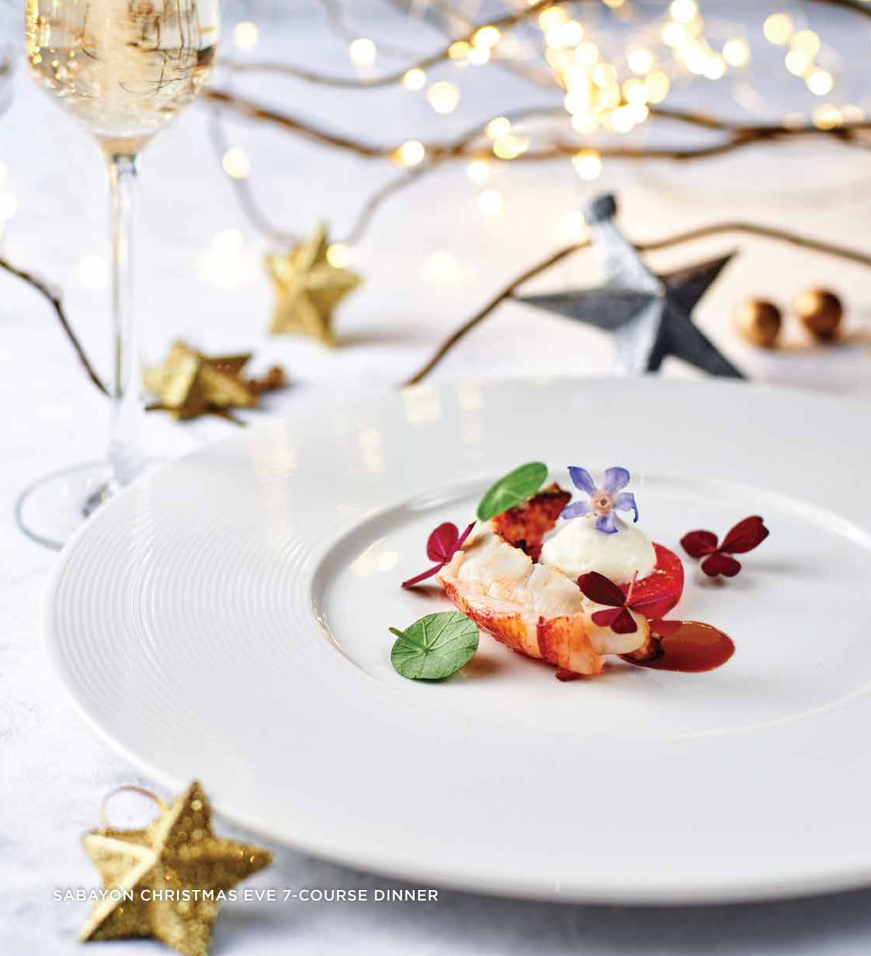
SABAYON CHRISTMAS EVE 7-COURSE DINNER