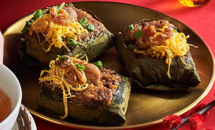
五壳丰收季 | 金钩栗子糯米饭 Glutinous rice with chestnuts, chicken, mushrooms wrapped in lotus leaf