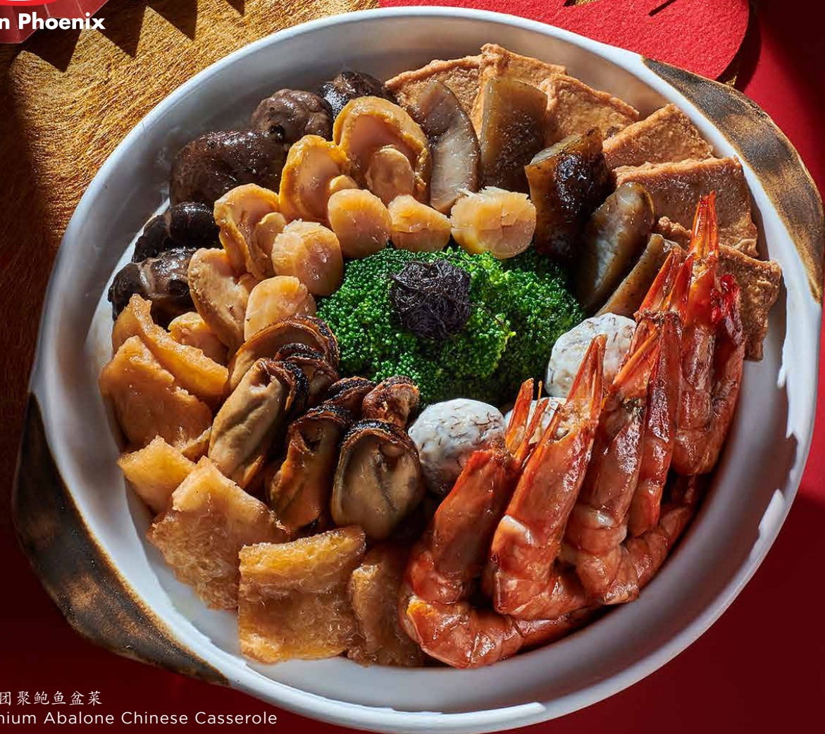
丰盛团聚鲍鱼盆菜 Premium Abalone Chinese Casserole