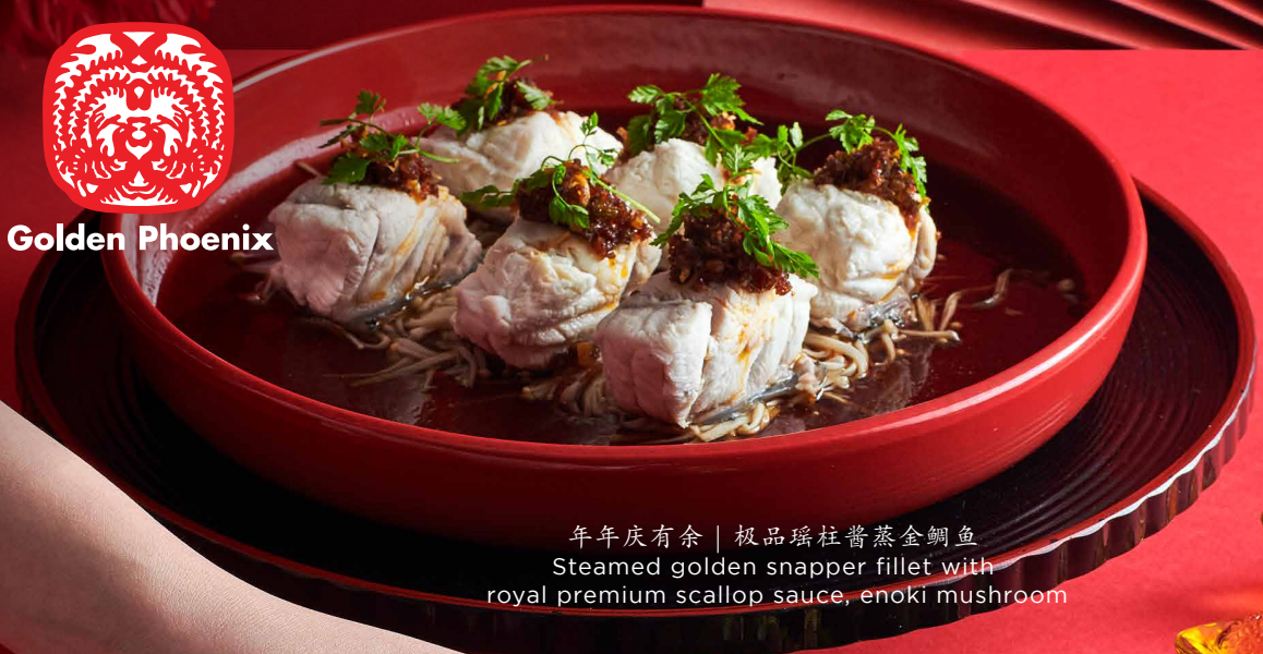
年年庆有余 | 极品瑶柱酱蒸金鲷鱼 Steamed golden snapper fillet with royal premium scallop sauce, enoki mushroom