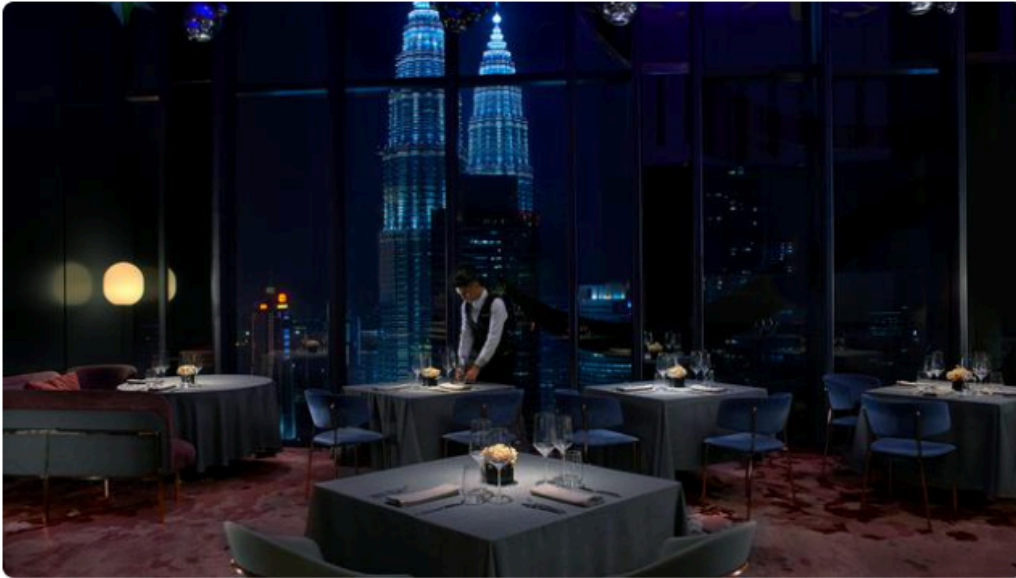
Sustainability is important to EQ too