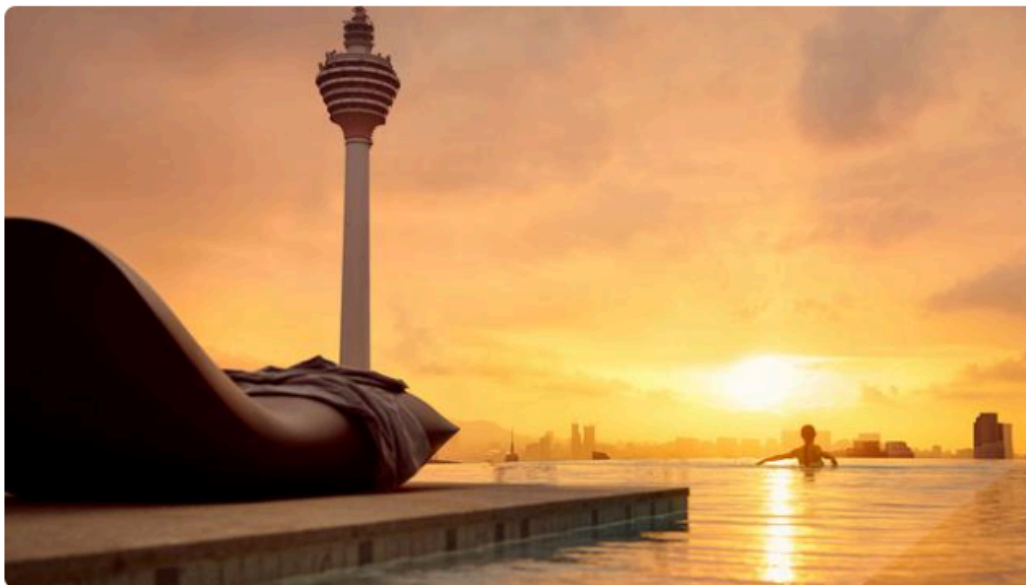
The pool gives you the best kind of vertigo