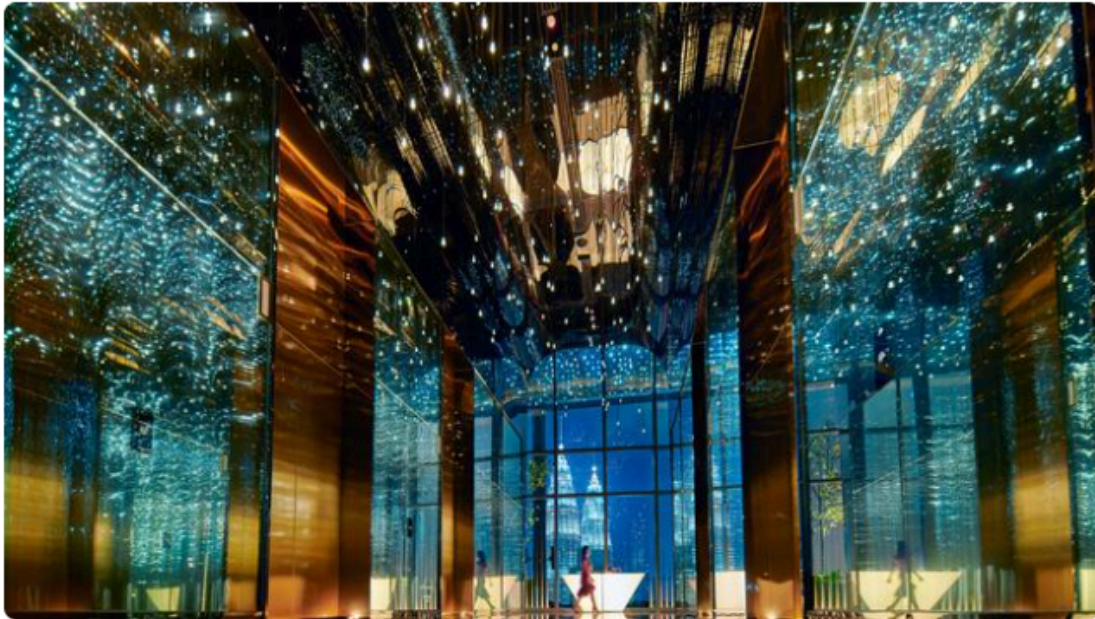
Some of the decor gave me a fright