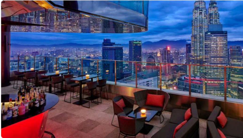
EQ staff really go above and beyond

Hospitality is etched into every facet of the EQ experience, however, when the chefs take time out of their busy morning service to explain the nuances between Chinese, Indian and Malaysian flavours sprinkled throughout the breakfast buffet. I consider that going over and above expectation. Snacks and soft drinks are also complimentary in room.