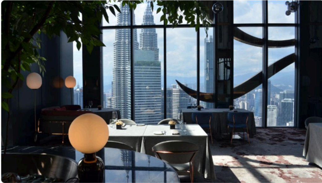
It sits in a prime location

Retaining it's Golden Triangle position on Jalan Sultan Ismail, EQ sits within the gravitational pull of the city's central business district, shopping, street-dining, nightlife and public transportation is conveniently close. But so too is a labyrinth of air-conditioned, undercover walkways linking Petronas Twin Towers, KLCC and high-end shopping malls Suria KLCC and Pavilion KL, making exploring by foot pleasant, even in KL's notorious heat and humidity.