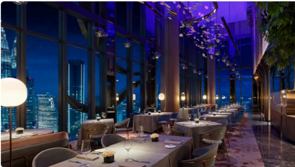
There are a range of dining options at EQ

Seven restaurants made dining an indulgent choice at EQ. Sabayon, located on EQ's highest floor was superb, skipping through seven Eurasian courses as a degustation. Next door, selections from Blue's 11 page beverage list can be coupled with bar bites through to bumps of Beluga caviar. While Sky51 is the smooth lounge bar beside, and the place to be for sunset - both for curated cocktails, and to watch Petronas Twin Towers aglow. Fresh teriyaki salmon poke bowls from Étoile Bistro were divine, as was the savoury, wok-fried carrot cake from Nipah - washed down with refreshing house-made lemonade. For a celebratory afternoon tea, visit Bottega, but swap out the teh tarik for Prosecco, and take time to savour EQ's undisputed icon; Kampachi, the name of KL's best Japanese over 5 decades.