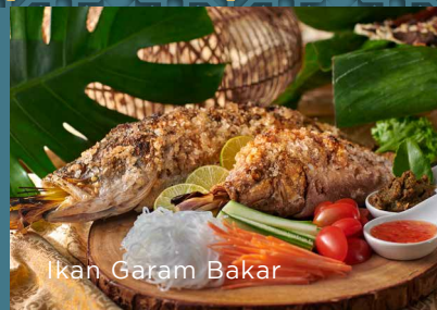
Ikan Garam Bakar