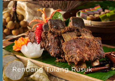
Rendang Tulang Rusuk