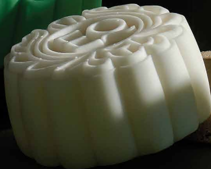
豆沙奶黄 Red Bean Custard